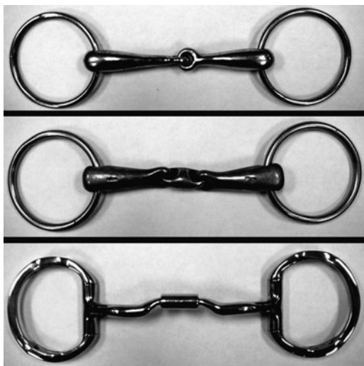
Fig. 1 Photographs of the three bits used in the study. Above, jointed snaffle; middle, KK Ultra; below, Myler comfort snaffle

Three bits (Fig. 1) were selected for evaluation: a single-jointed snaffle; a double-jointed KK Ultra bit and a Myler low-port comfort snaffle. The single-jointed snaffle had a hollow mouthpiece with a loose ring attachment to the cheek pieces of the bridle.